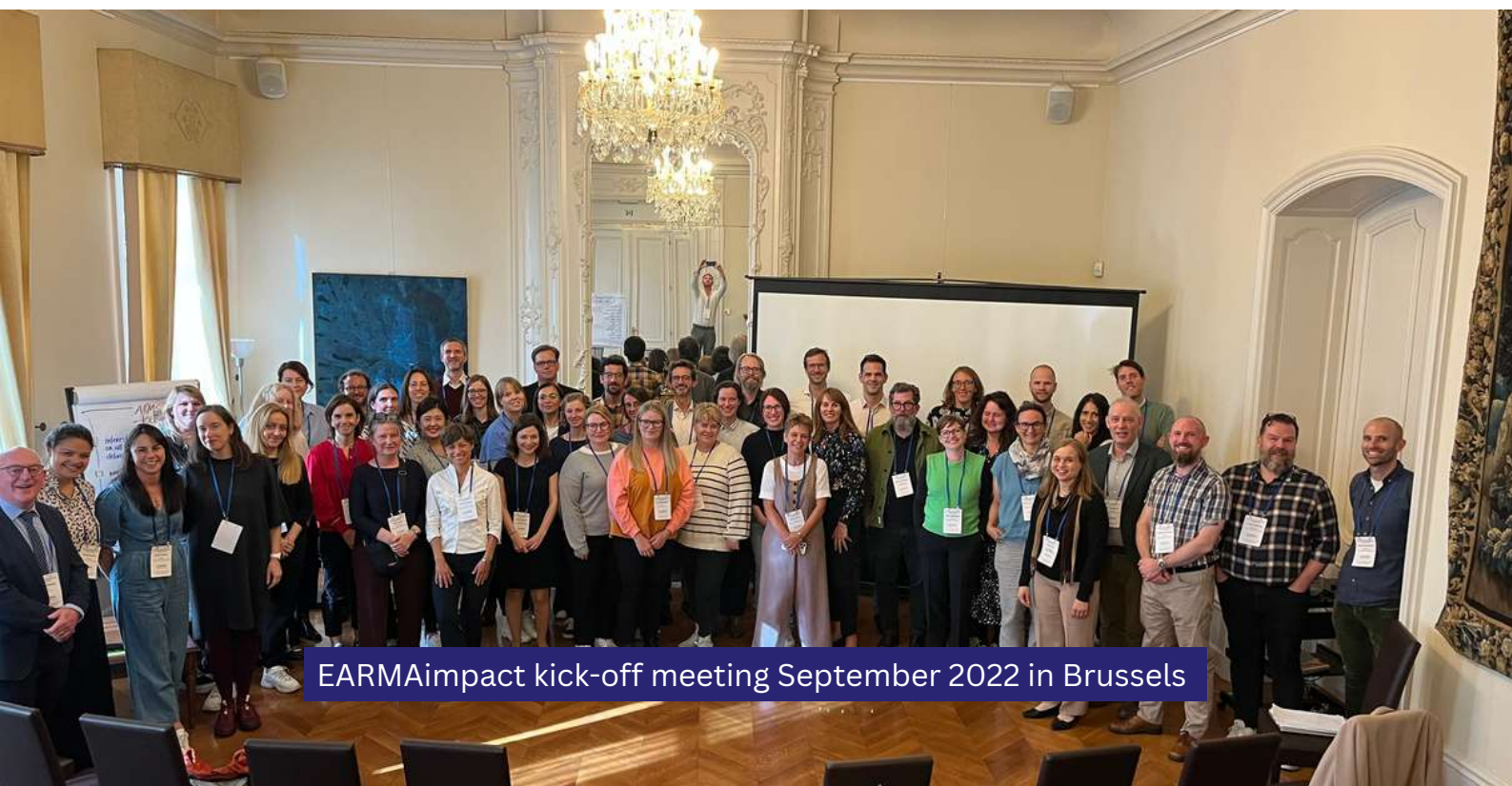
EARMAimpact kick-off meeting September 2022 in Brussels

The group’s membership has grown to 312 members.