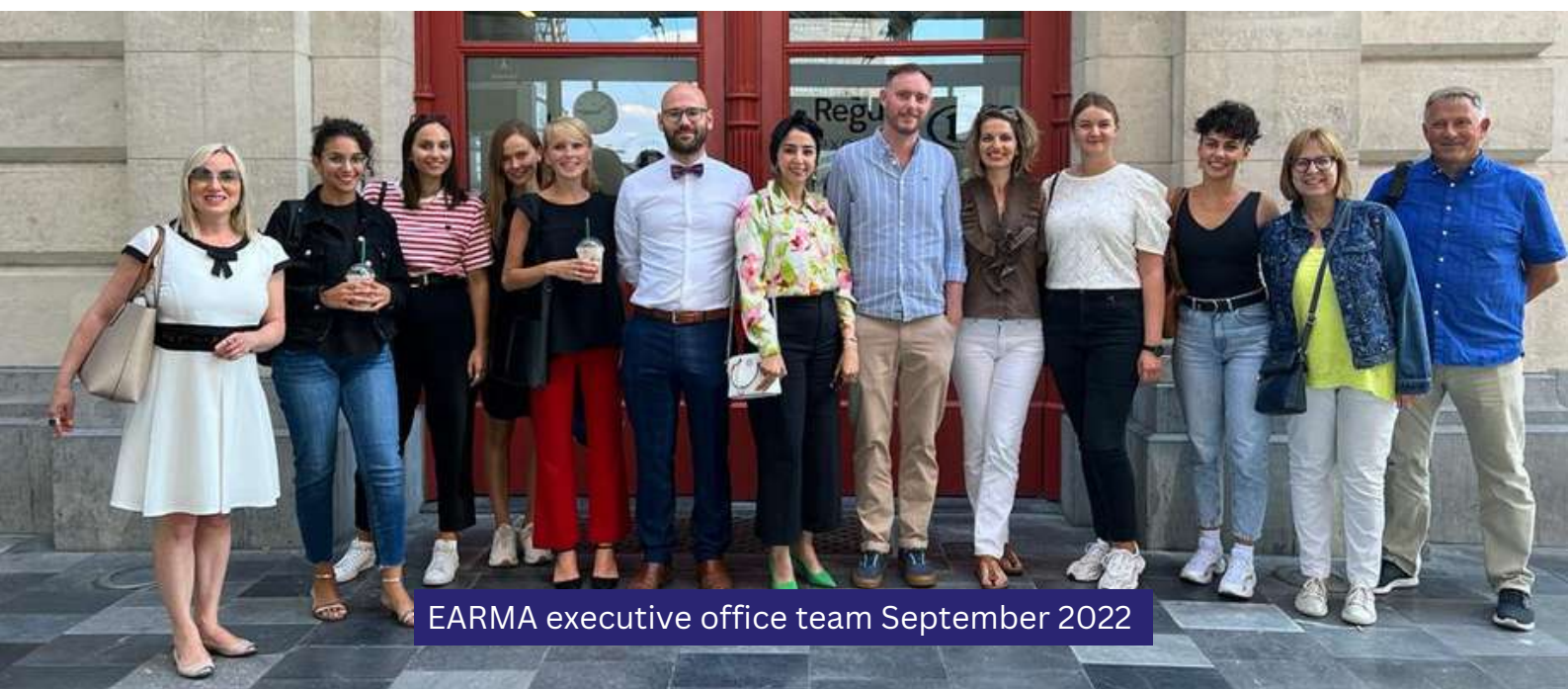
EARMA executive office team September 2022

EARMA becoming an employer has brought additional responsibilities which we are continuously reviewing to ensure that EARMA is an employer of choice and employees have a fulfilling and enjoyable career. Investment in the executive office is essential to deliver the Association's strategic objectives.