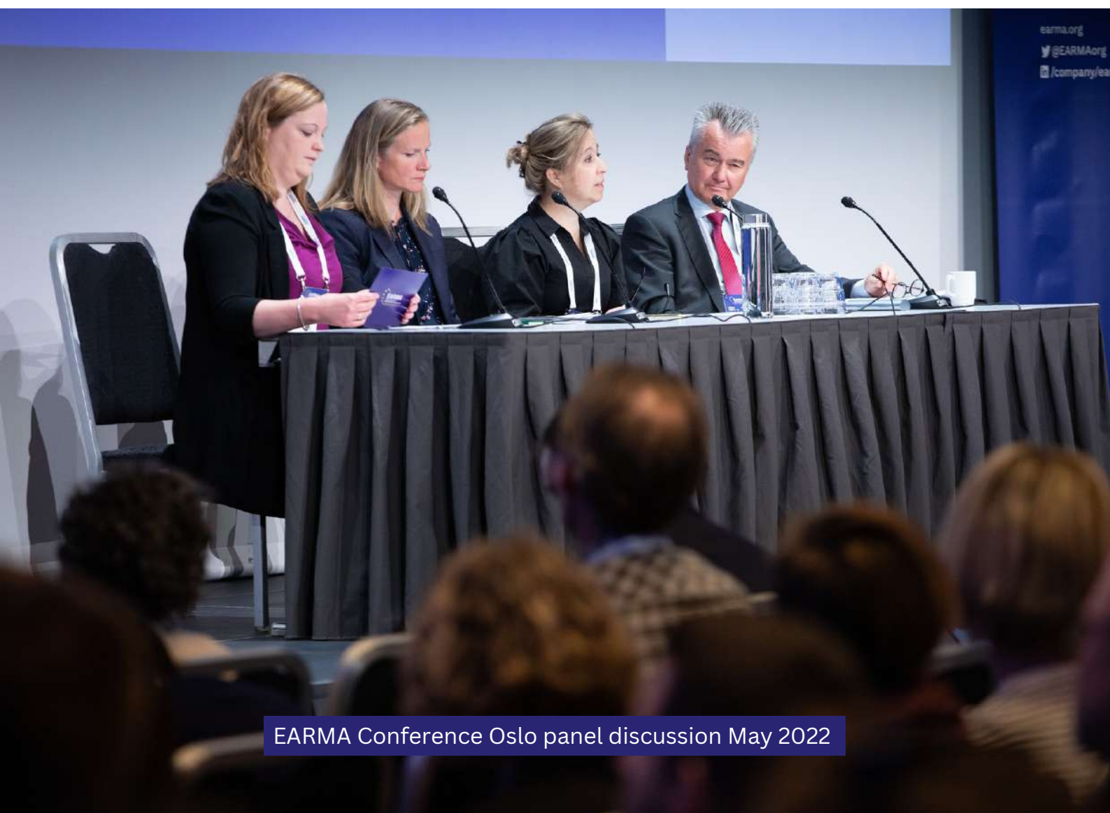
EARMA Conference Oslo panel discussion May 2022

EARMA's website is an active one and gathers around 40,000 pageviews per month. The new EARMA website was introduced towards the end of 2021 and the essential information from the previous was transferred to earma.org. Improvements were made and multimedia elements added throughout 2022 to increase engagement and accessibility. With the introduction of the EARMA Community Platform, we have great opportunities to further utilise the collaboration spaces and enhance communications potential going forward.