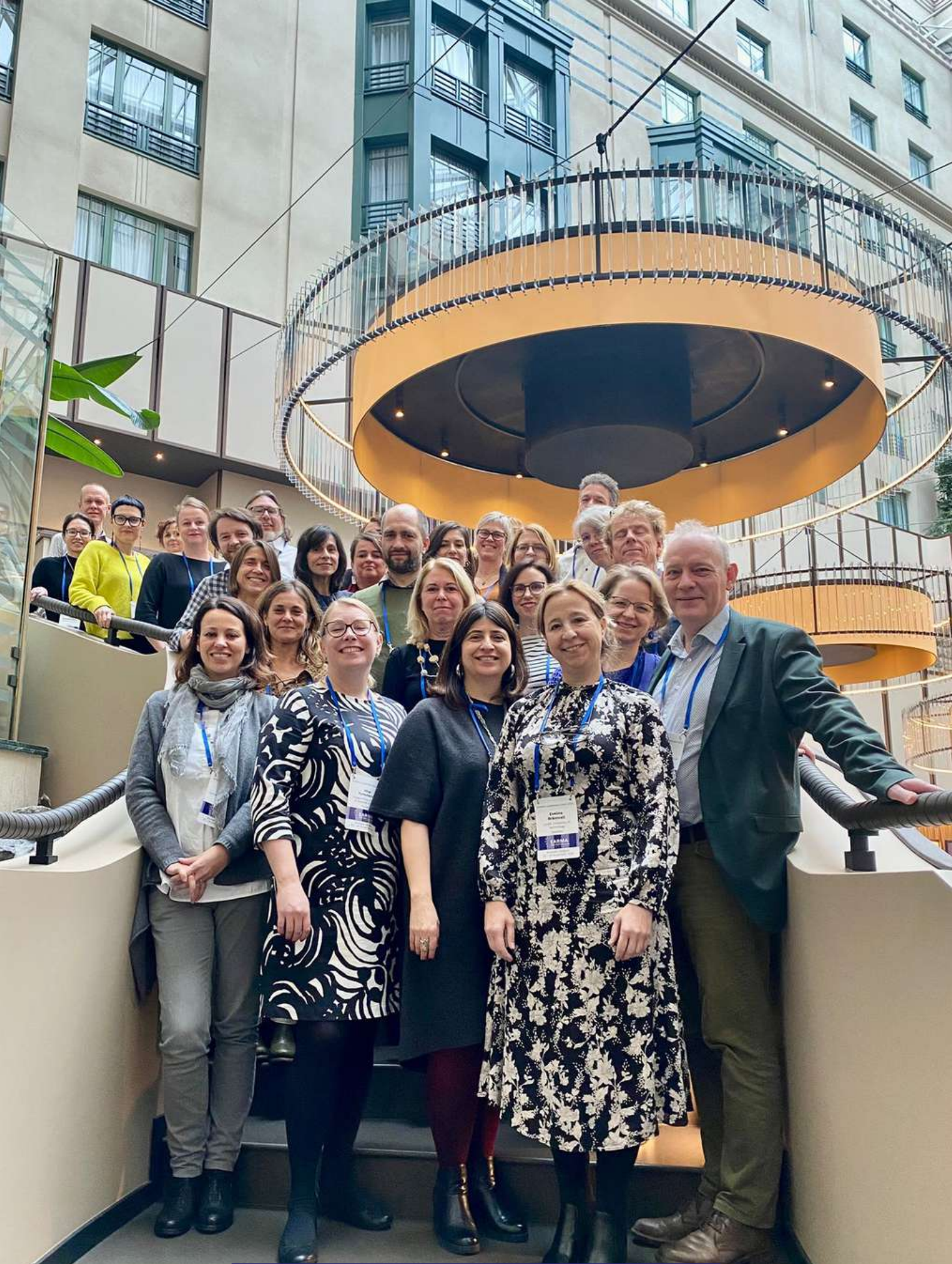
EARMA Leadership Event Brussels November 2022