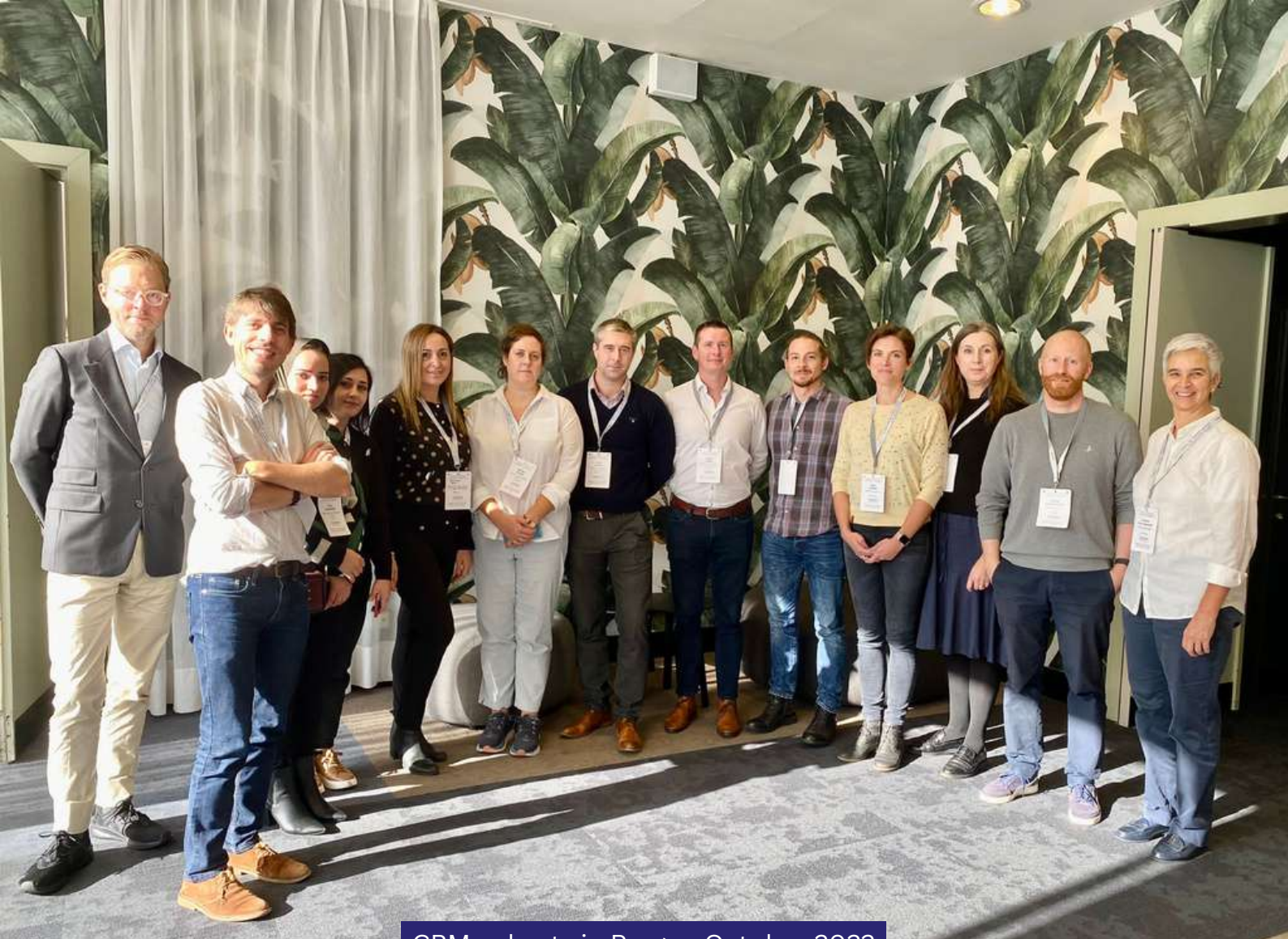
CRM cohorts in Prague October 2022