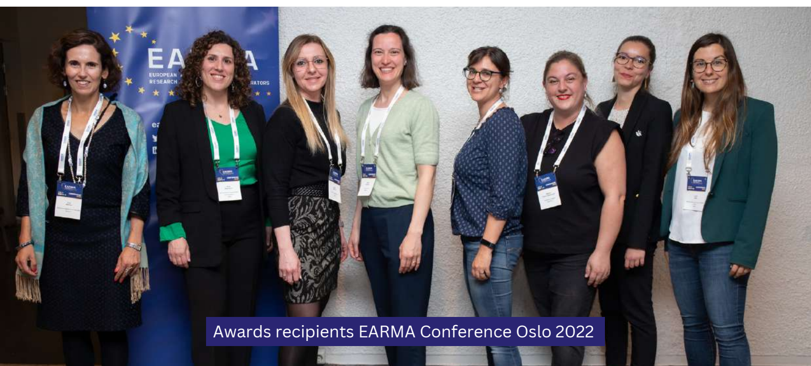
Awards recipients EARMA Conference Oslo 2022